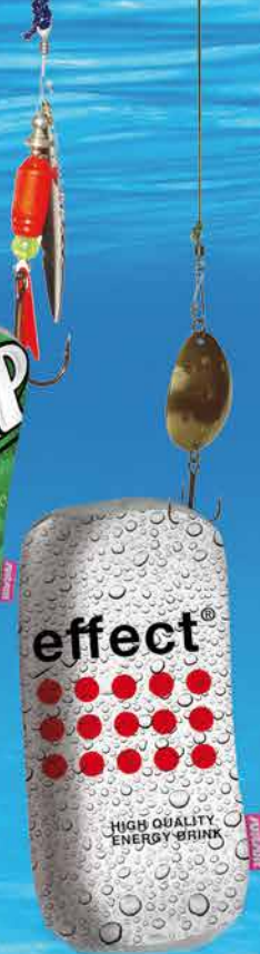
EFFECT ENERGY DRINK