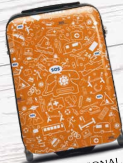
SOS INTERNATIONAL 20"