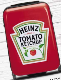
H. J. HEINZ 20"