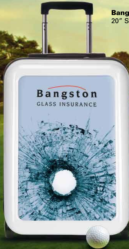
Bangston 20" Suitcase Sticker