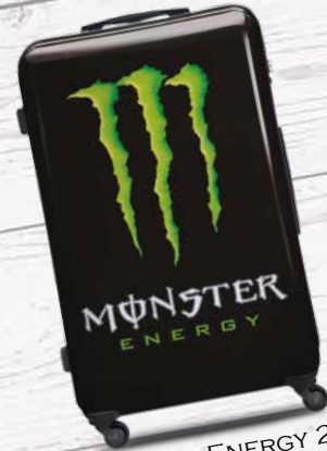
MONSTER ENERGY 24"