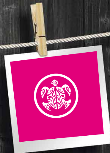
GENERAL INFORMATION 38